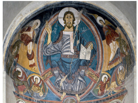
Church of Sant Climent, Taüll, Spain

These are some examples of the same story in different artistic mediums - stone, enamel, and fresco. This imagery was common in Western Christianity during the Middle Ages. See if you can identify the elements discussed in the video!