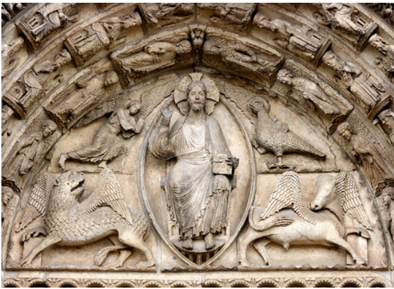
Chartres Cathedral, France

Watch this clip about the chapel within the Cave of the Apocalypse on Patmos