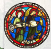
Catherine of Alexandria